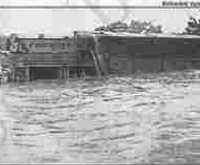
Barmer is a district in Gujarat that is known for its desert landscape.

place in Barmer, 600 people in the region died of tuberculosis. The state government's health department is yet to wake up to the situation.