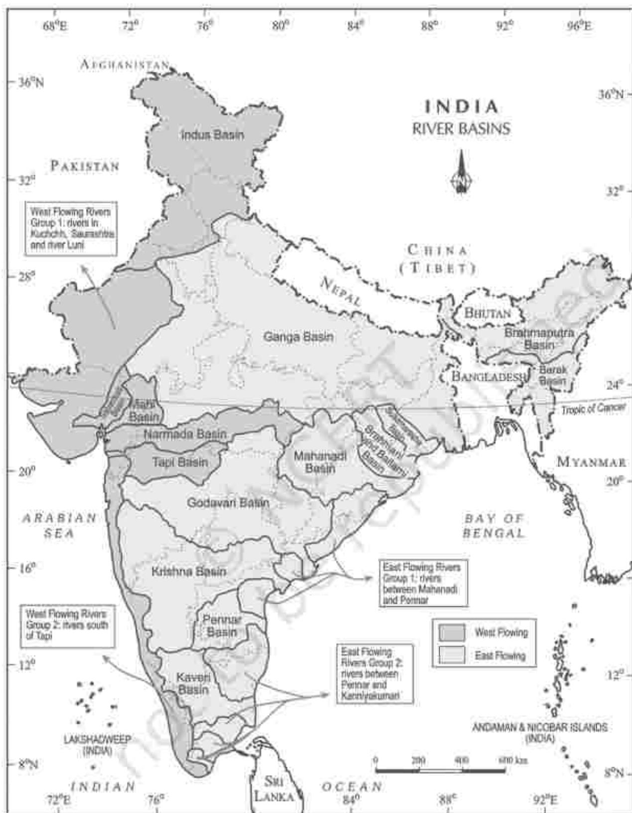
Fig. 4.1 : India - River Basins