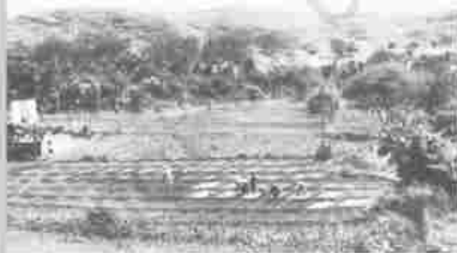
Ralegan Siddhi after mitigation approach

At present, water is adequate, agriculture is flourishing, though the use of fertilisers and pesticides is very high. The prosperity also brings the question of ability of the present generation to carry on the work after the leader of the movement who declared that, "The process of Ralegan's evolution to an ideal village will not stop. With changing times, people tend to evolve new ways. In future, Ralegan might present a different model to the country."