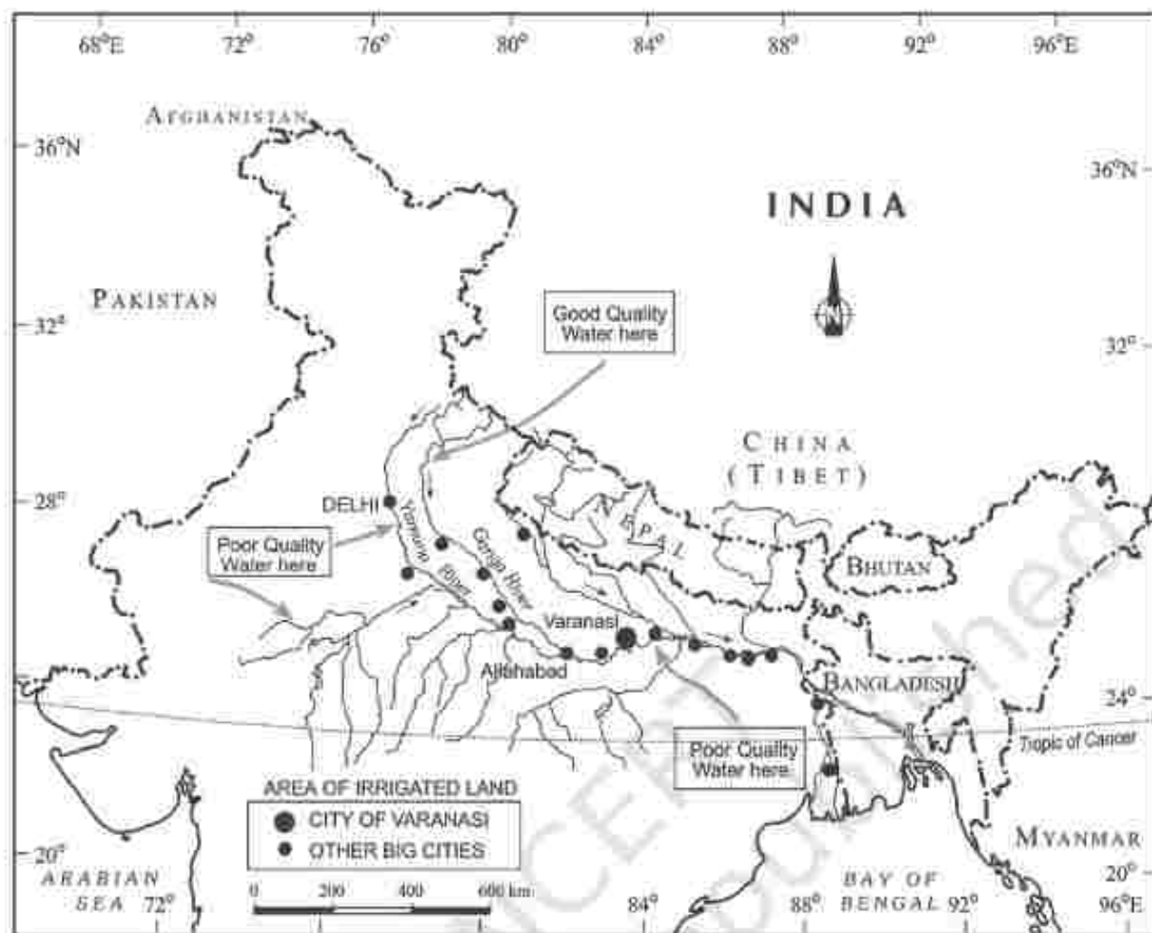
Fig. 4.2 : The Ganga and its Tributaries and Towns Located on them

gets polluted by foreign matters, such as micro-organisms, chemicals, industrial and other wastes. Such matters deteriorate the quality of water and render it unfit for human use. When toxic substances enter lakes, streams, rivers, ocean and other water bodies, they get dissolved or lie suspended in water. This results in pollution of water, whereby quality of water deteriorates affecting aquatic systems. Sometimes, these pollutants also seep down and pollute groundwater.