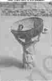
In the state of Gujarat, Barmer is a district that is known for its desert landscape.