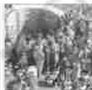
The World Water Council (WWC) is a global organization that promotes the sustainable use of water resources.

There have been more than 500 conflicts over water in the past century, but it's also an agent of cooperation.