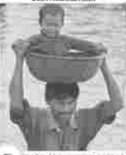
In the state of Gujarat, Barmer is a district that is known for its desert landscape.

Discuss the issues highlighted in the news items.