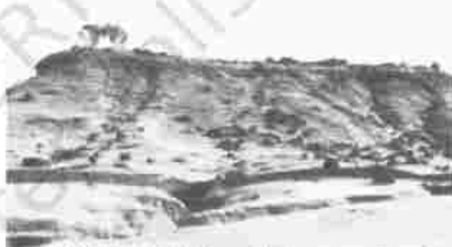
Ralegan Siddhi before mitigation approach

A Rs 22 lakh school building was constructed using only the resources of the village. No donations were taken. Money, if needed, was borrowed and paid back. The villagers took pride in this self-reliance. A new system of sharing labour grew out of this infusion of pride and voluntary spirit. People volunteered to help each other in agricultural operation. Landless labourers also